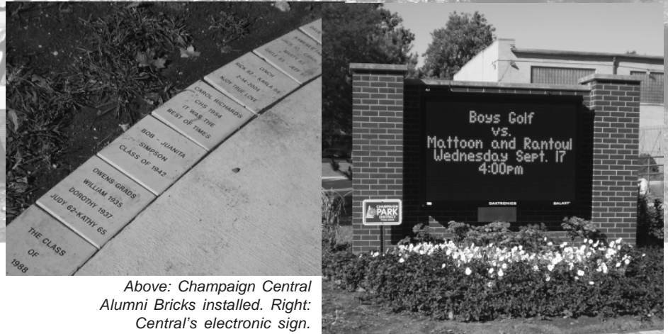
Above: Champaign Central Alumni Bricks installed. Right: Central's electronic sign.

and installation of a maroon and white garden to enhance the sign and path. Personalized concrete bricks, a fundraiser for the CHSAA, are embedded in the ground along the sidewalk. The bricks are a wonderful way to honor a recent or long-time graduate of Champaign Central High School. You can purchase a brick online at www.ChampaignAlumni.com , Give2Schools.com (CUSF's secure on-line giving site or by mail through the Foundation. The continuing sales of these bricks will help pay for upcoming projects of the Alumni Association. If you live in the area and haven't seen the updated corner yet it is worth driving by for a look. If you come back for a visit, stop by!