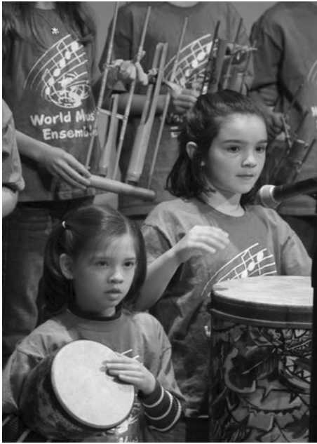
Students perform for a Unit 4 Board Meeting playing traditional world instruments in the Music Without Borders Ensemble project.